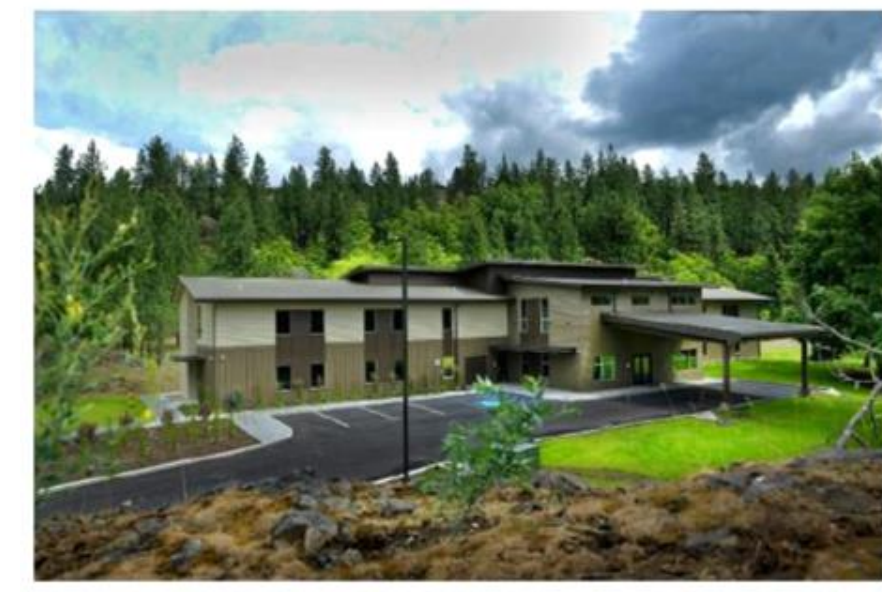
Commerce BHF-funded facility in Spokane Valley, WA