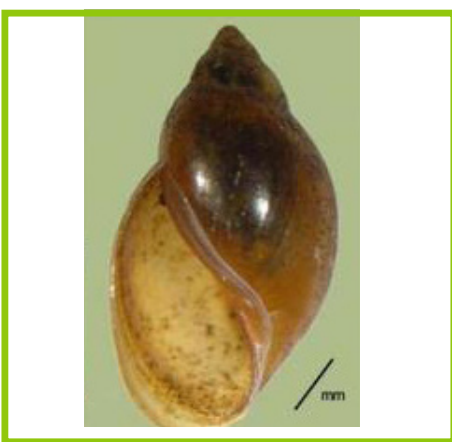
LEFT POUCH SNAIL