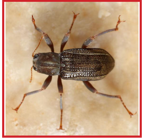
ADULT RIFFLE BEETLE