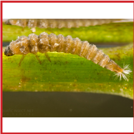
RIFFLE BEETLE LARVAE