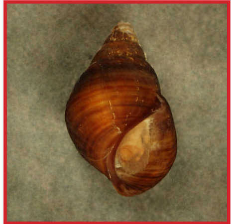
RIGHT-HANDED GILLED SNAIL