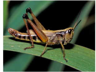
MEADOW GRASSHOPPER Pseudochorthippus parallelus