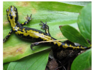
LONG TOED SALAMANDER Ambystoma macrodactylum