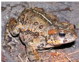
WESTERN TOAD Bufo borea