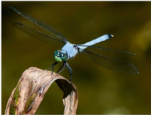
EASTERN PONDHAWK Erythemis simplicicollis