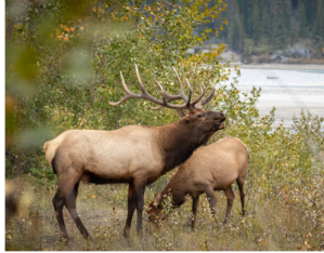
ELK Cervus elaphu