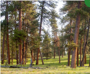
PONDEROSA PINE Pinus ponderosa