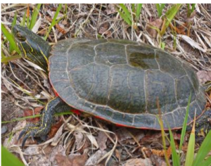
PAINTED TURTLE Chrysemys picta