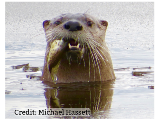
RIVER OTTER Lontra canadensis