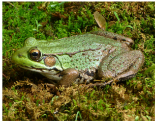
NORTHERN GREEN FROG Rana Lithobates clamitans