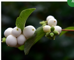
COMMON SNOWBERRY Alces alces