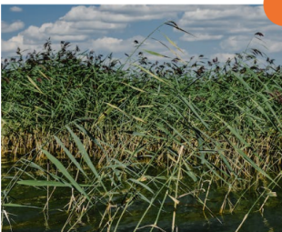
REED CANARY GRASS Phalaris arundinacea