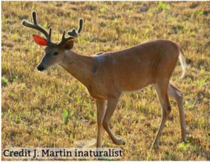
NORTHWEST WHITE-TAILED DEER Odocoileus virginianus ochrourus