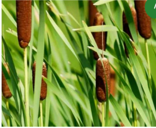
CATTAIL Typha spp.