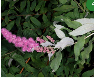
DOUGLAS SPIREA Spiraea douglassi