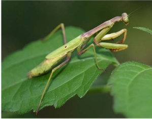
CAROLINA MANTIS Stagmomantis carolina