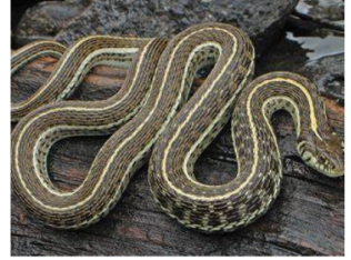
GARTER SNAKE Thamnophis