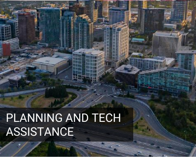
PLANNING AND TECH ASSISTANCE