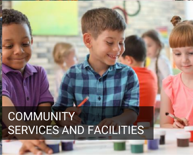
COMMUNITY SERVICES AND FACILITIES