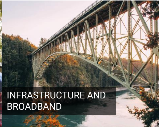
INFRASTRUCTURE AND BROADBAND