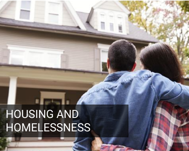
HOUSING AND HOMELESSNESS