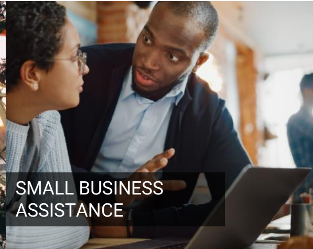
SMALL BUSINESS ASSISTANCE