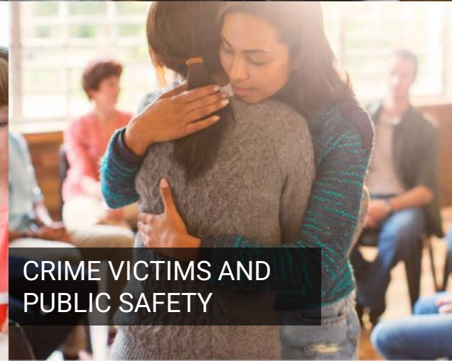
CRIME VICTIMS AND PUBLIC SAFETY