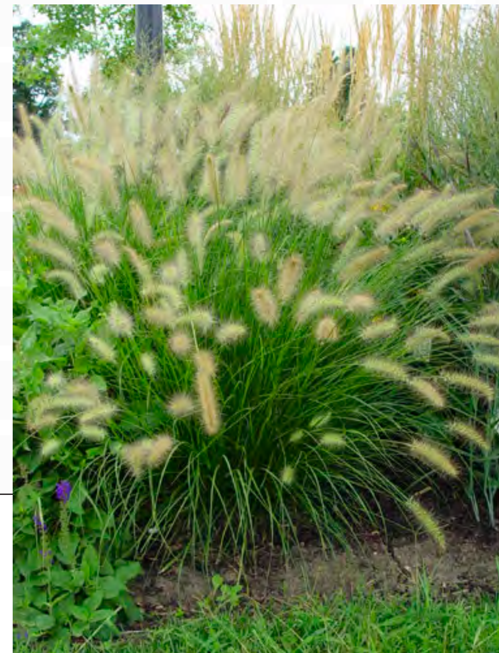
DWARF FOUNTAIN GRASS