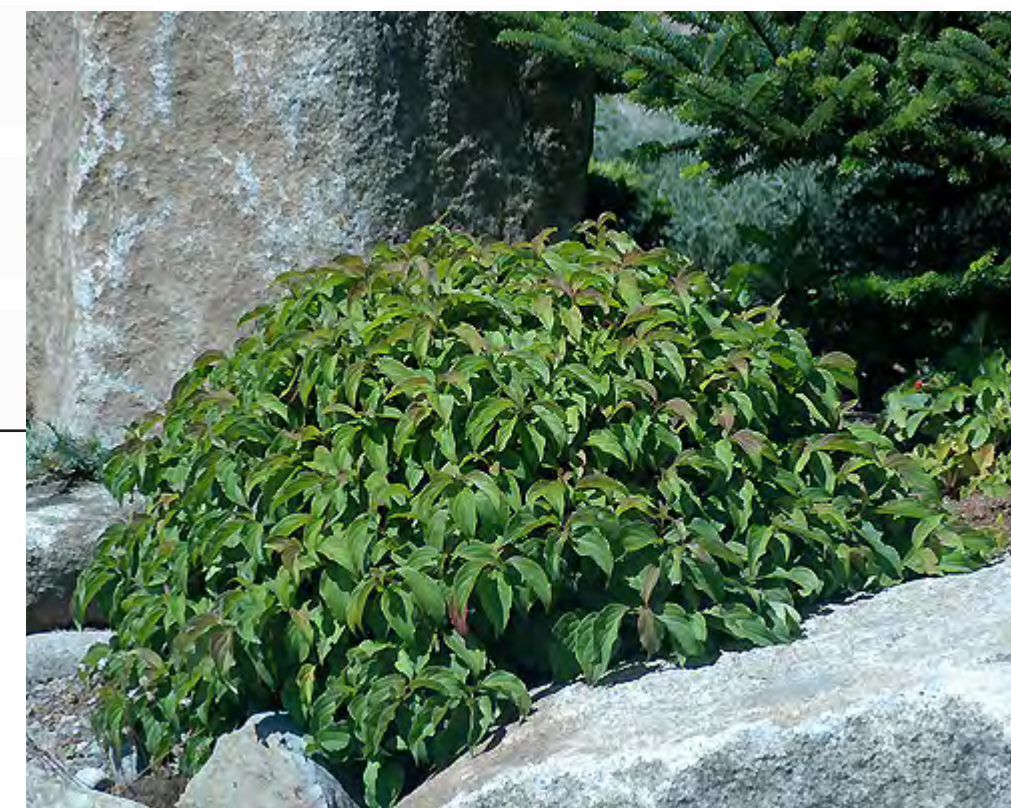
DWARF RED OSIER DOGWOOD