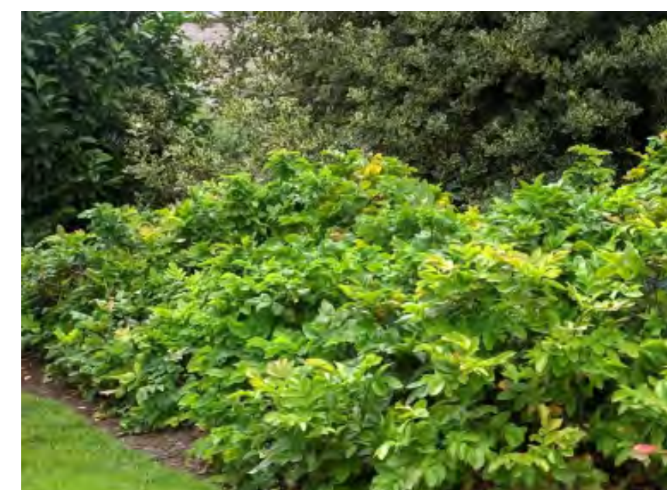
CREeping OREGON GRAPE