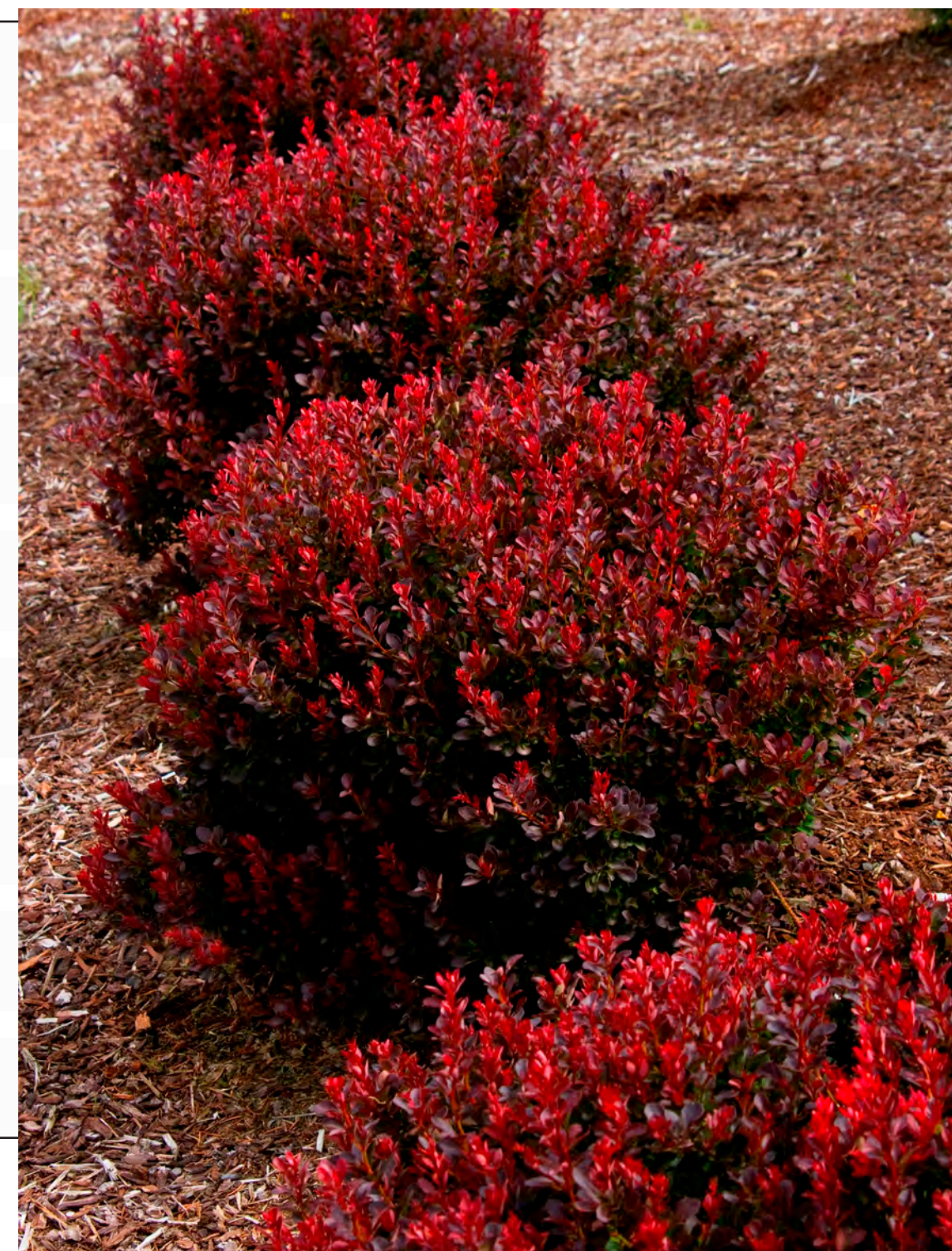
PYGMY RUBY BARBERRY