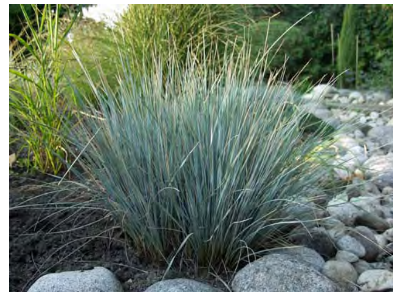
BLUE OAT GRASS