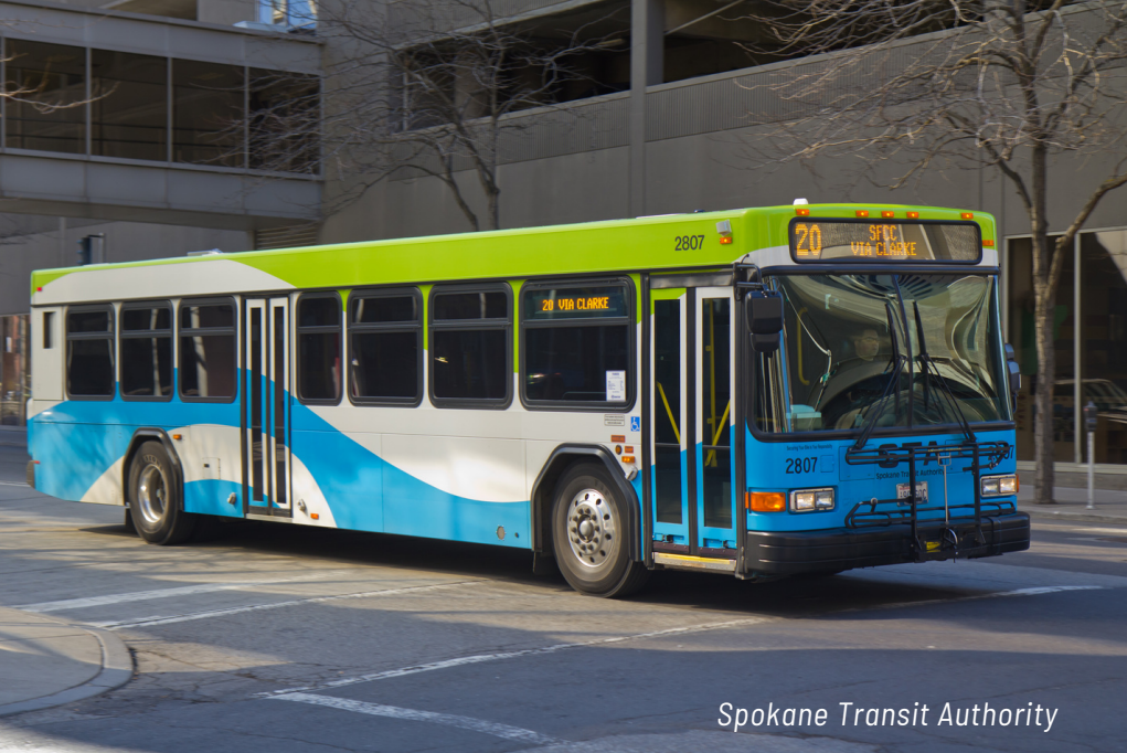
Spokane Transit Authority

The Treasurer's Office manages over $20 billion in transactions for our clients annually.