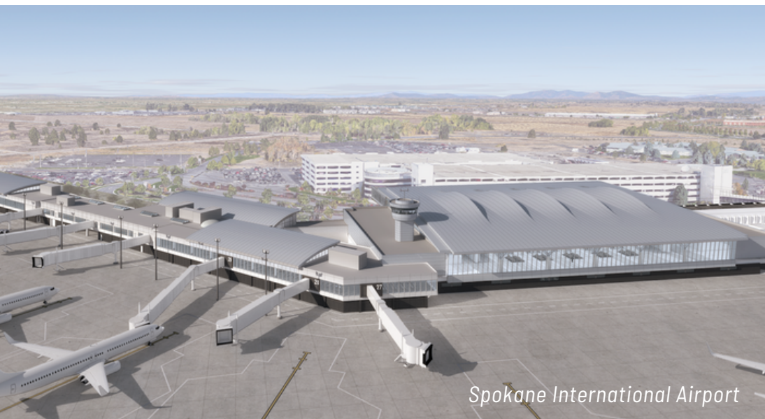
Spokane International Airport