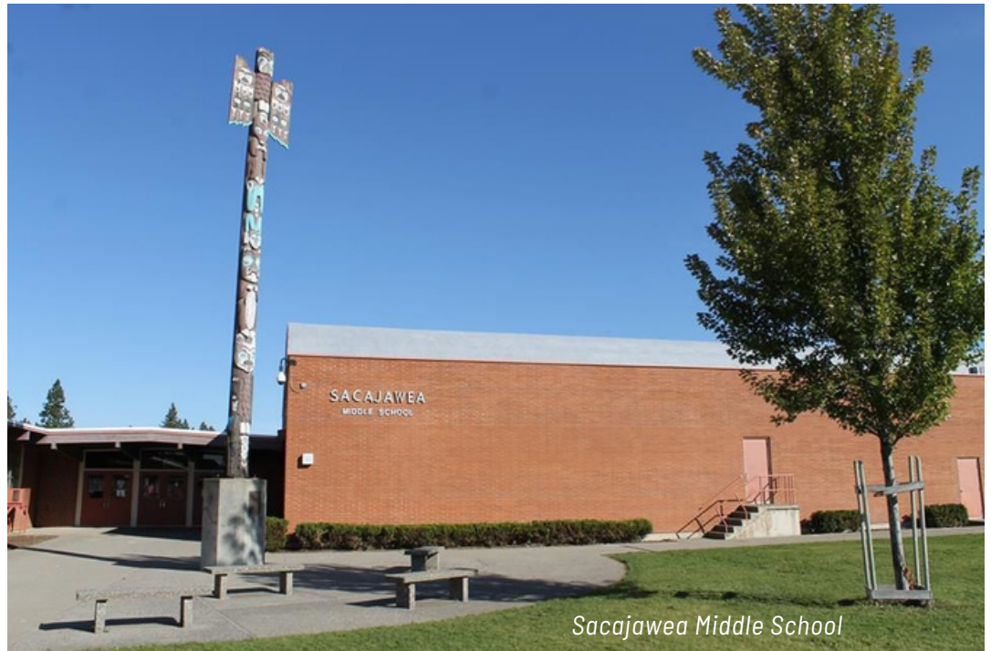
Sacajawea Middle School