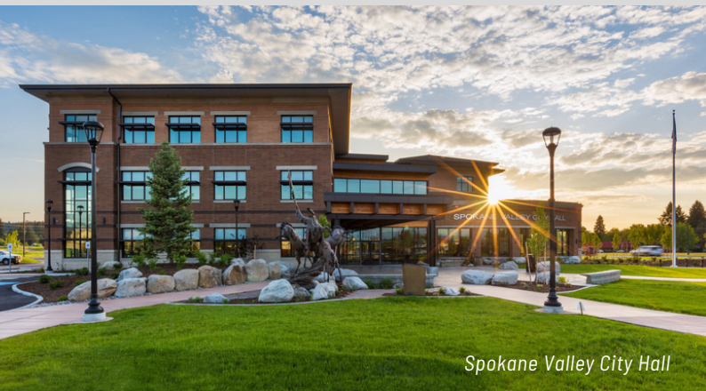
Spokane Valley City Hall

We know that not everyone finds it convenient to travel downtown to visit our office at the County Courthouse, so we once again partnered with the City of Spokane Valley to set up a satellite collection point at the Spokane Valley City Hall during the Spring and Fall tax collection periods of 2023. We provided in-person tax collection services for over three hundred taxpayers at this additional convenient location.